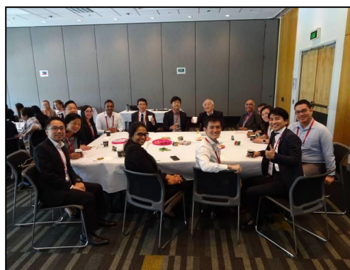
At Brisbane on 14 November 2019