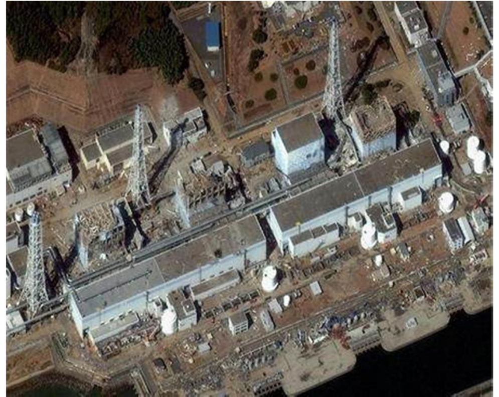
Fukushima Nuclear Power Plant No.1