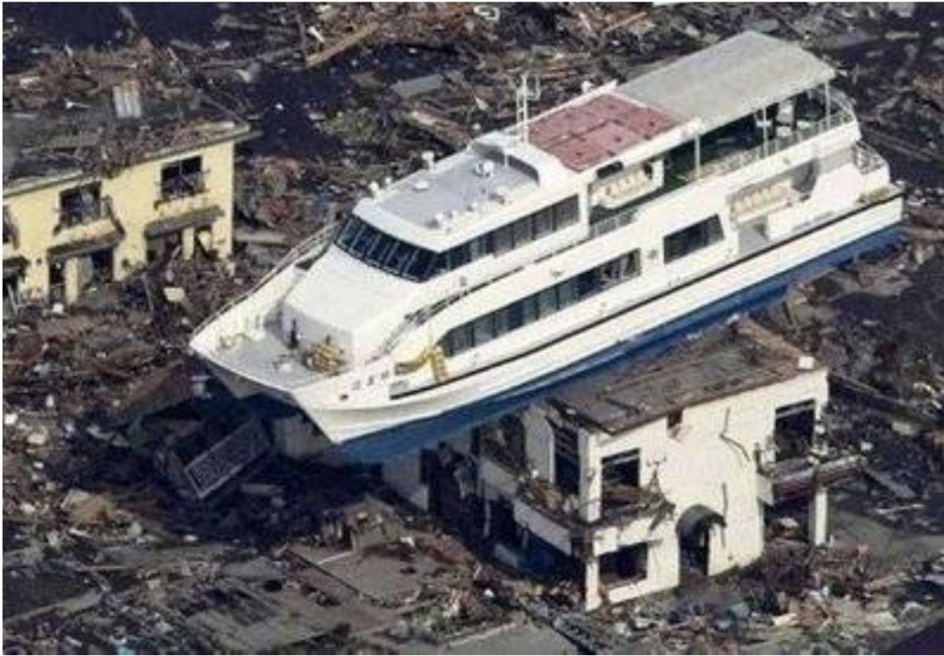
Ferry Boat on the building by Tsunami