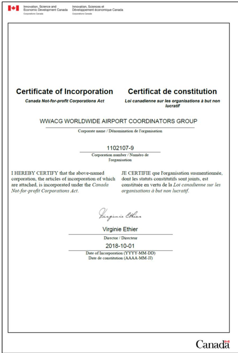
(Certificate of Incorporation)